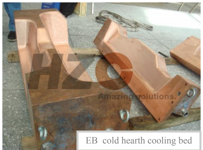
EB cold hearth cooling bed