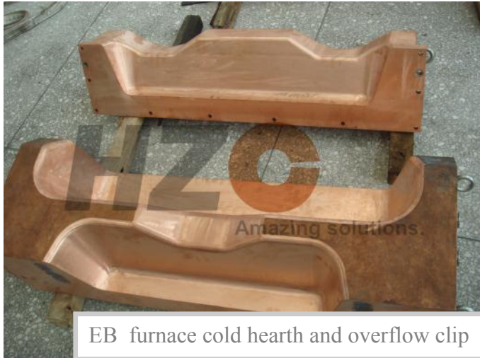
EB furnace cold hearth and overflow clip

The cold hearth is mainly used for EBCHR, EBCHM, PACHM Furnace to remelting and refining refractory and reactive metals and alloys.