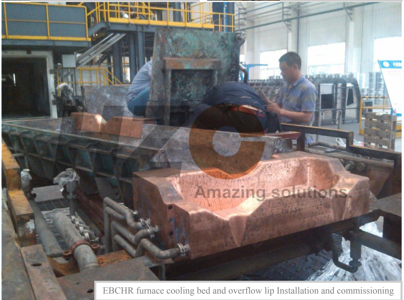
EBCHR furnace cooling bed and overflow lip Installation and commissioning