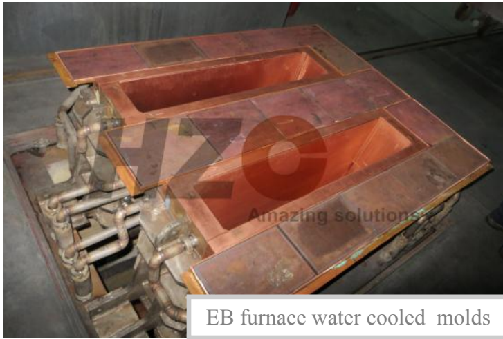
EB furnace water cooled molds