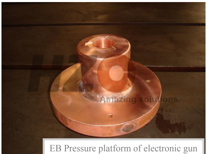
EB Pressure platform of electronic gun