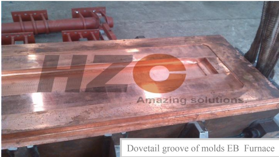
Dovetail groove of molds EB Furnace

EB furnace is mainly employed for the production of refractory and reactive metals (tantalum, niobium, molybdenum, tungsten, vanadium, hafnium, zirconium, titanium) and their alloys.